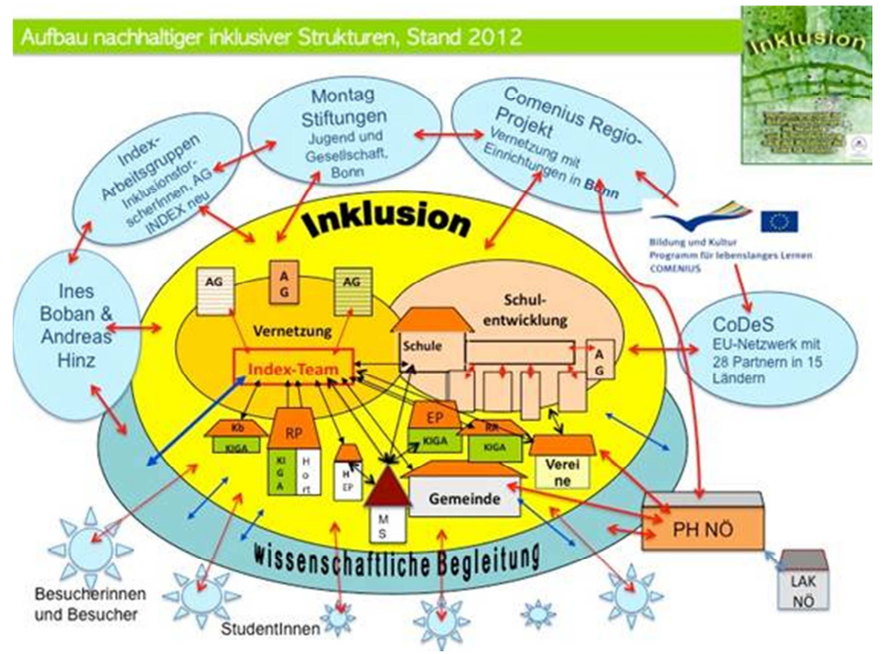
Fig. 4: Sustainable Structures in 2012 (Gebhardt, 2013)

From 2006 to 2010 the Index was used in the town of Wiener Neudorf – the project was subject to a formative evaluation process by the University College of Teacher Education in Lower Austria (Braunsteiner, Germany 2009, 2011). Educational institutions (including kindergartens, which in Austria are not a part of the public schools) and the town community wanted to improve their cooperation. They were guided by inclusive values by adopting a self-review approach based on the Index for Inclusion. Figure 4 shows the networks that have been formed since 2006. See also: <a href="http://www.wiener-neudorf.gv.at/Zusammenleben/Inklusion">http://www.wiener-neudorf.gv.at/Zusammenleben/Inklusion</a>